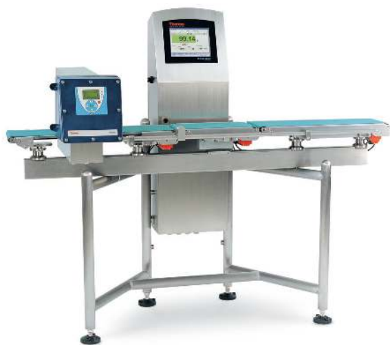
APEX 300 and Thermo Scientific™ VersaWeigh™ combination system