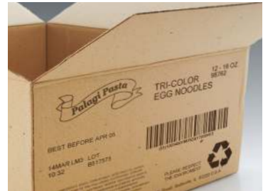
High-resolution text, bar codes and logos on shipping cases