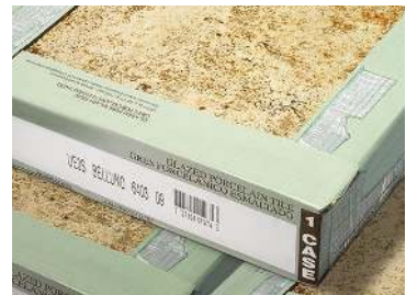
POS packaging for oversized items