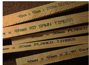
Direct applied to building materials