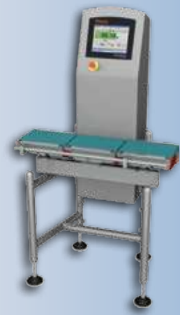
Thermo Scientific VersaWeigh General purpose checkweigher